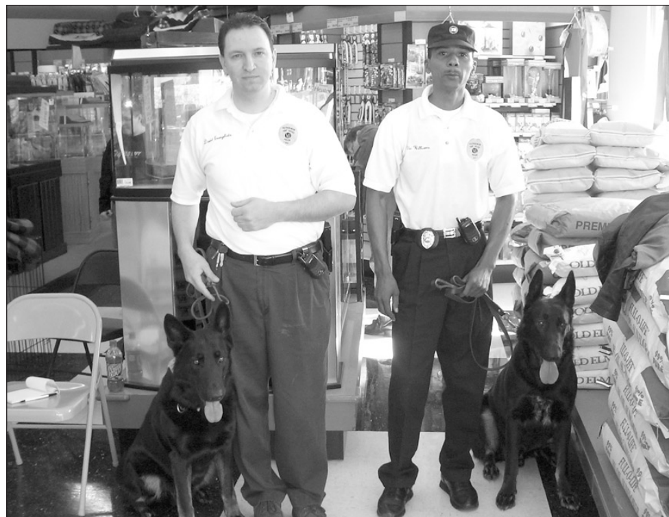
Asap and Justice are two of six dogs from the Nelson County Animal Shelter who have become K-9 officers. The two dogs now work for the Vine Grove Police Department.