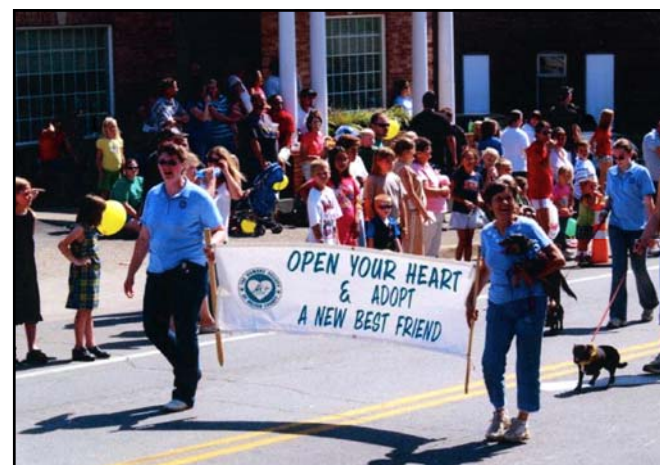
Iron Horse Festival Parade

Cinders brought joy and love to all she met, whether human, canine, or feline. We will miss her.