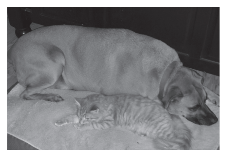
Max with his canine buddy