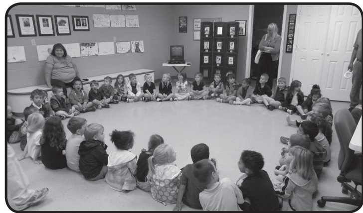
In October, this well-behaved Early Childhood group visited the shelter where they had a tour and played with a kitten and puppy. Their art work is displayed on the walls.