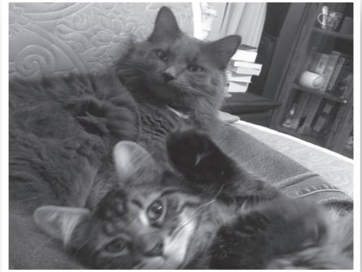
Gus, in foreground, waving, and Grady, behind him

After losing two cats to old age, I wanted a companion for my other elderly, now-clingy remaining cat. My only criteria were that the new addition be a male and a kitten. It was believed that our remaining cat,